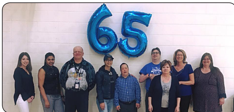
WSA staff and individuals celebrating our 65th Anniversary!